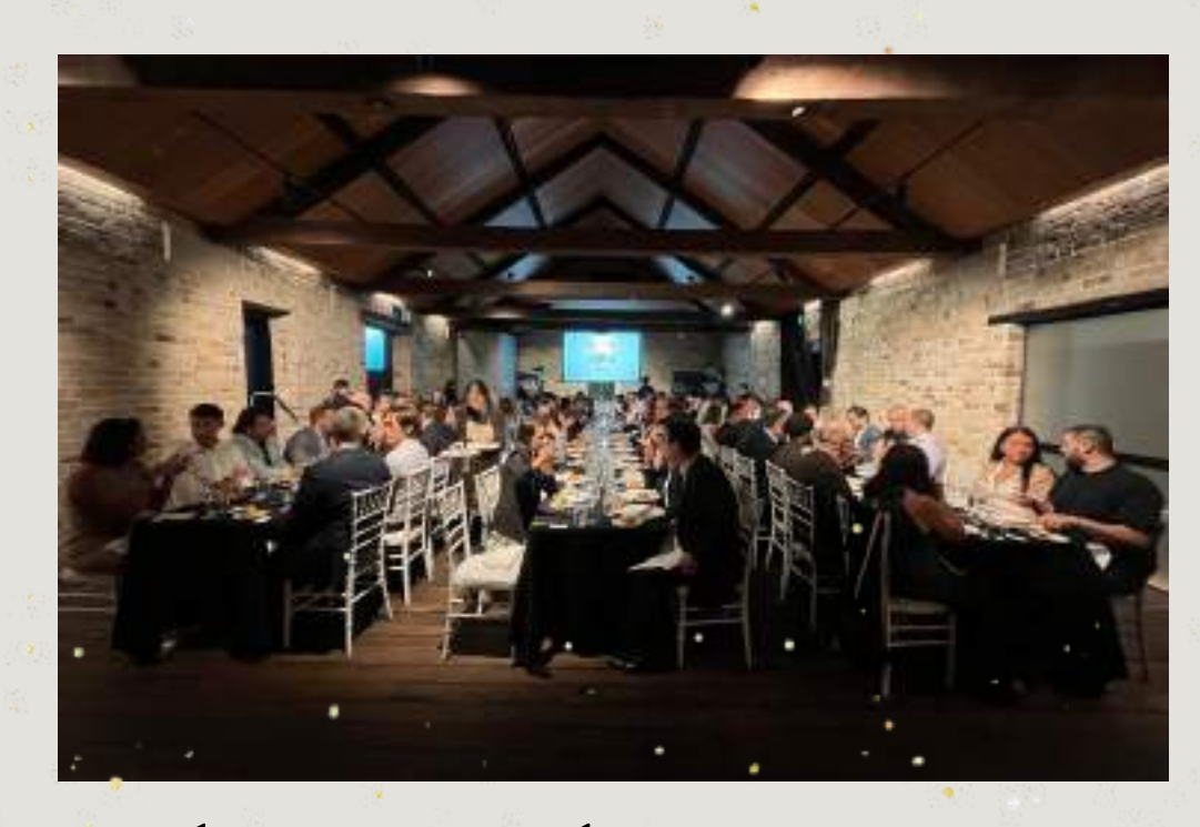
Policy Week [2024]