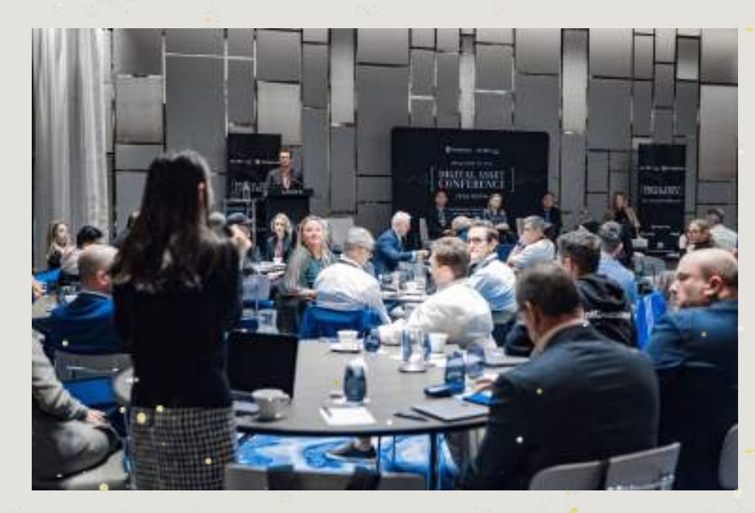
Digital Asset Conference [2023]